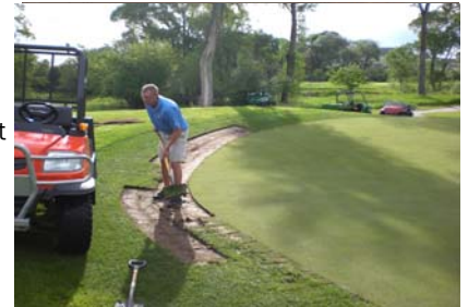
A past intern works on reshaping a putting green collar. (Drew Kleinmeyer: Iowa State Univ.).

The goal of our program is to prepare interns for their first job in turfgrass management. We work individually with interns on strengths and weaknesses to better prepare them for the increasingly tight job market. Our program includes pesticide and fertilizer applications, irrigation expansion/repair, crew supervision, mechanic instruction, safety meeting presentations, and golf outings to nearby facilities.