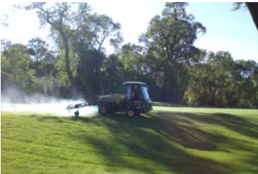
Interns will gain spraying experience.