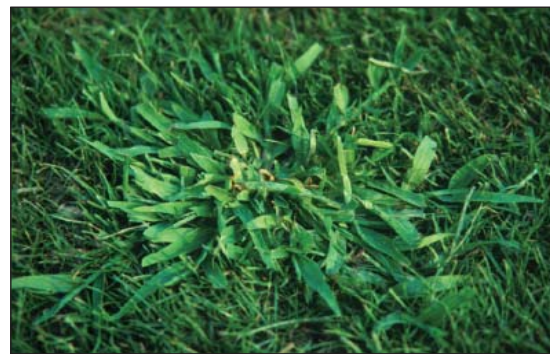
Figure 1. Mature crabgrass plant (Zac Reicher).

Irrigate deeply and infrequently. Daily, light irrigations promote shallow rooting, non-drought hardy turf, and encourage crabgrass. Water to wet the soil to the depth of rooting, and then do not water again until you see the first sign of drought stress (When drought stressed, turf will become bluish gray and footprints will remain in the turf after it is walked on).