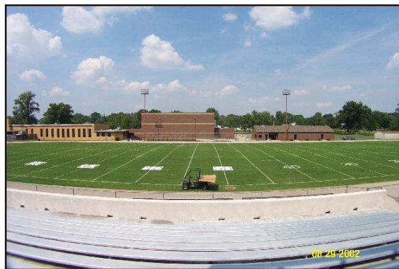
Figure 5. Overseeded bermudagrass football field at the end of October in Evansville, Indiana.

Bermudagrass has several advantages over perennial ryegrass and Kentucky bluegrass for use in athletic fields, including aggressive summer growth and better disease tolerance. Although bermudagrass might not be appropriate for every field, it will provide cover on overused summer and fall-use fields. Using bermudagrass in southern Indiana and southern Illinois can improve safety, playability and aesthetics of athletic fields.