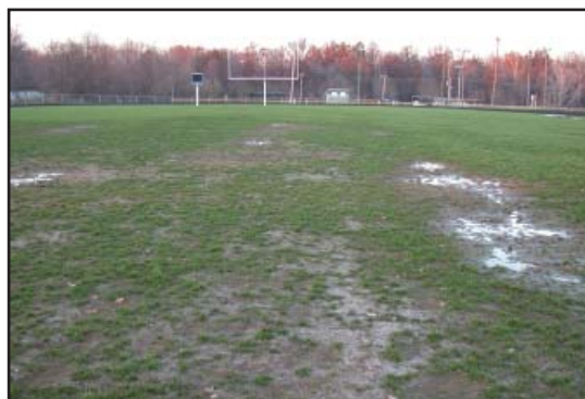
Figure 1. Heavily trafficked athletic field

Turf quality on municipal athletic fields is typically poor due to excessive traffic from soccer and football. These heavily trafficked fields often have compacted soils that reduce turf density. Aside from poor playability and poor turf quality, heavily trafficked sports fields provide less cushion and increase the risk of athlete injury.