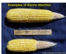
Examples of kernel abortion at tip of ears.

Click on image to open a larger version. Click on larger version to close popup window.