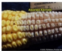
Closer view of aborted kernels.

Severe drought stress that continues into the early stages of kernel development (blister and milk stages) can easily abort developing kernels. Severe nutrient deficiencies (especially nitrogen) can also abort kernels if enough of the photosynthetic "factory" is damaged. Extensive loss of green leaf tissue by certain leaf diseases, such as common rust or gray leaf spot, by the time pollination occurs may limit photosynthate production enough to cause kernel abortion.