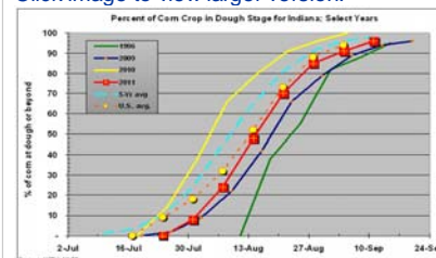
Fig. 1. Percentage of Indiana's corn crop at dough stage OR BEYOND; 11 Sep 2011.