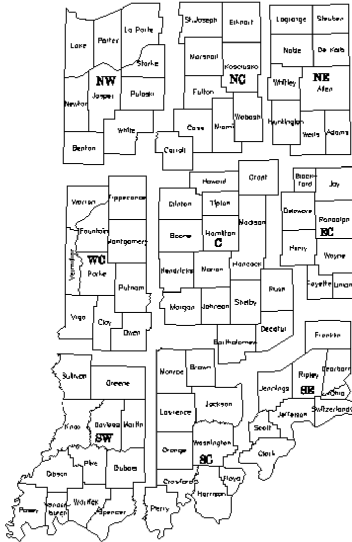
Fig. 2. Indiana crop reporting districts as identified by USDA-NASS.