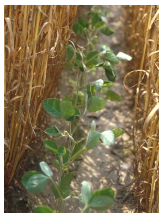
Soybeans Intercropped with Wheat

Planting time of relay intercropped soybean is usually based on the wheat's physiological stage rather than calendar date. Most studies have shown that soybeans should be seeded before head emergence of the wheat.