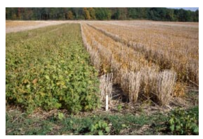
Maturity Differences Between Double-crop (left) and Relay Soybean Between Rows of Winter Wheat (right)

sive traffic damage in wheat harvest (resulting from combine tire widths totaling almost 5 feet in the narrow 15-foot plots) and the inclusion of data from 1999 (with well below-normal rainfall in July and August). In growing seasons with sufficient moisture, a reasonable expectation is that relay soybean yields between 50 and 60 percent of full-season soybean.