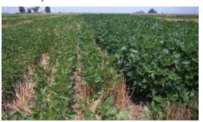
Successful Establishment of Relay Soybean versus Monocrop Soybean Seeded the Same Day

Glyphosate-resistant soybeans are recommended for this system because of this herbicide's excellent crop safety and its ability to control volunteer wheat and other late-