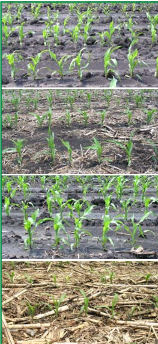
Figure 3. This figure shows corn plant height variability in different rotation-tillage systems. (From top) Corn-soybean, plow; corn-soybean, no-till; continuous corn, plow; and continuous corn, no-till.