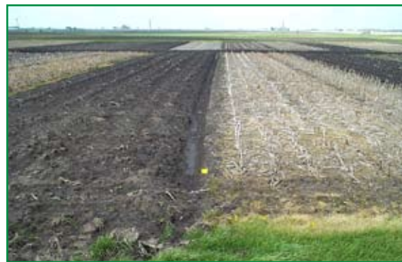
Figure 2. This photo shows a pre-planting comparison of the continuous corn, plow (left) and continuous corn, no-till systems in the Purdue University long-term rotation and tillage experiment.

From 1981 to 1994, the ongoing, long-term rotation and tillage experiment at Purdue University's Agronomy Center for Research and Education used a single corn hybrid (Becks 65X) planted near the rows from the preceding year. Full weed control was achieved by applying residual herbicides and hand weeding as necessary. The experiment measured corn plant height and yield for two crop rotations (corn-soybean and continuous corn) and two tillage systems (moldboard plow and no-till).