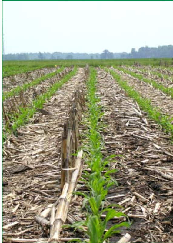
Figure 6. In no-till continuous corn, plant new rows next to the previous year's rows to avoid variable germination, emergence, and early seedling growth. Early-season variability can lead to variations in plant size, which can reduce grain yield.

Use seed firmers in high-residue seedbeds to ensure consistent seed spacing and depth — which in turn, improves plant-to-plant uniformity (Nielsen, 2001). Uniform seed spacing and depth are also promoted by avoiding no-till planting directly into old cornrows, and by properly managing surface residue to prevent it from interfering with the planter's furrow opening and closing operations (Steinhardt et al., 2002). Tined