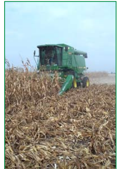
Figure 1. Higher grain prices have caused many growers to consider corn-dominant rotations.

This publication discusses some real causes of yield loss in no-till corn after corn related to corn growth and development and provides remedies for alleviating them.