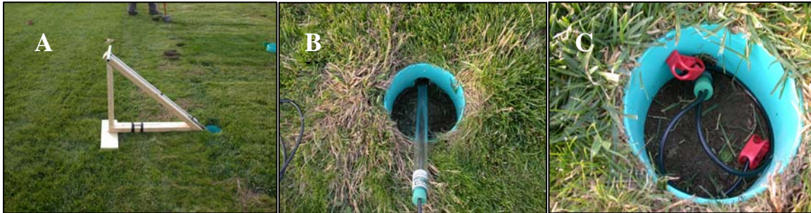
Figures A-C. Lysimeters were installed at 45 cm below the soil surface using a guide and a soil probe.