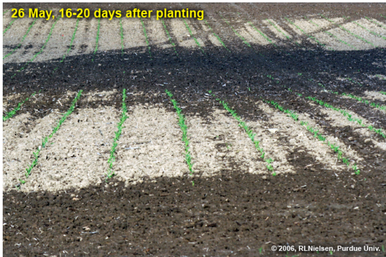
Fig. 1. Uneven corn emergence in 2006 due to uneven (too wet vs. "just right") seedbed soil moisture.

Adequate and uniform soil temperature at the seed zone. Corn will germinate and emerge slowly and/or unevenly when soil temperatures are less than 50F. When soils warm to the mid-50's or warmer, emergence will occur in seven days or less if soil moisture is adequate. Thermal time from planting to emergence is approximately 115 growing degree days (GDDs) using the modified growing degree formula (Nielsen, 2012) with air temperatures or about 119 GDDs based on soil temperatures.