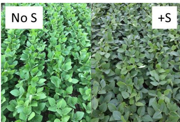
Fig. 3. Soybeans without S and with 20 pounds sulfur per acre.

Sulfur deficient crops typically have an overall yellow appearance ( Fig. 3 & 4 ) similar to N deficiency. However S is not as mobile in the plant as N, so lower leaves do not show more severe deficiency symptoms than the upper leaves. If a S deficiency is misdiagnosed as a N deficiency the application of fertilizer N will make the S deficiency worse, so tissue sampling is recommended to positively identify which nutrient is deficient. In corn, S deficiency may also cause leaf striping ( inset Fig. 4 ) which is easily confused with magnesium, manganese, and zinc deficiency.