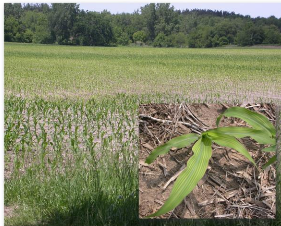
Fig. 4. Areas of sulfur deficiency (pale green) and sufficiency (dark green) in an Indiana corn field caused by variations in soil properties. Young corn that is sulfur deficient may show striping as well as an overall yellow color.