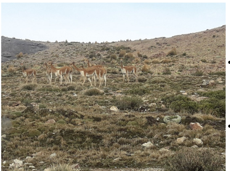
Highland wetlands in Caylloma