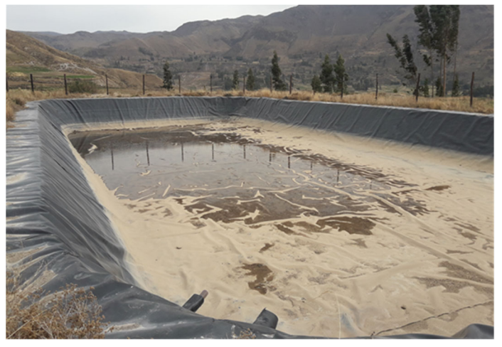
Reservoir in Lari at the end of the dry season