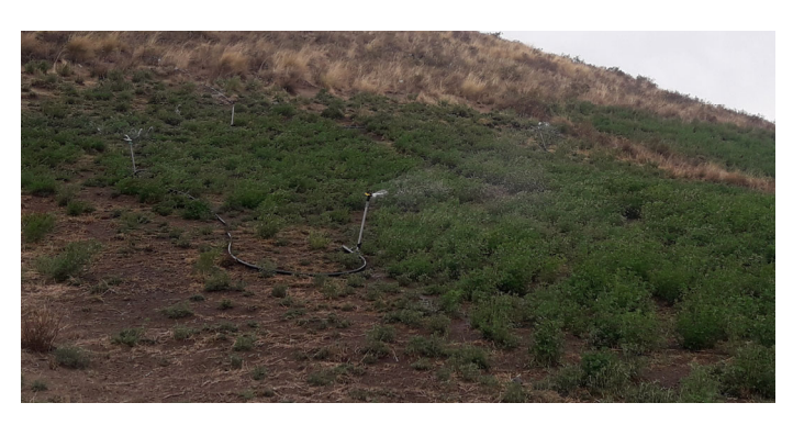
Sprinklers in Lari