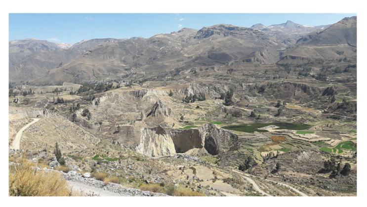
Lagoon of Colors, Colca Valley