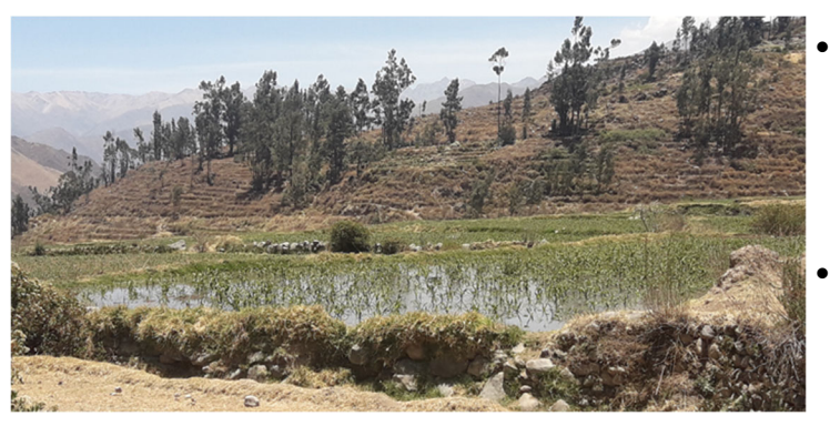
Irrigation in Cabanaconde

On water management in the districts, the people interviewed mention the following points: