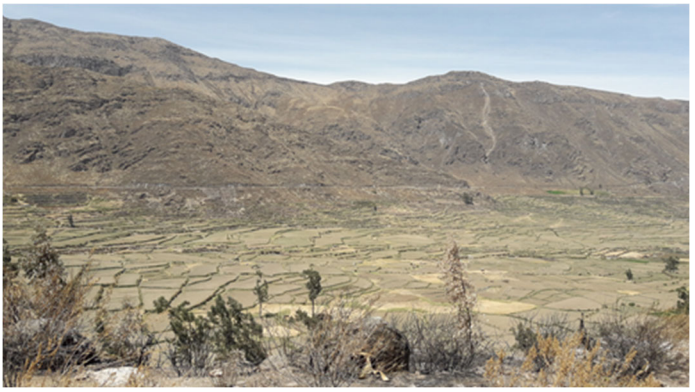
Cabanaconde in the dry season