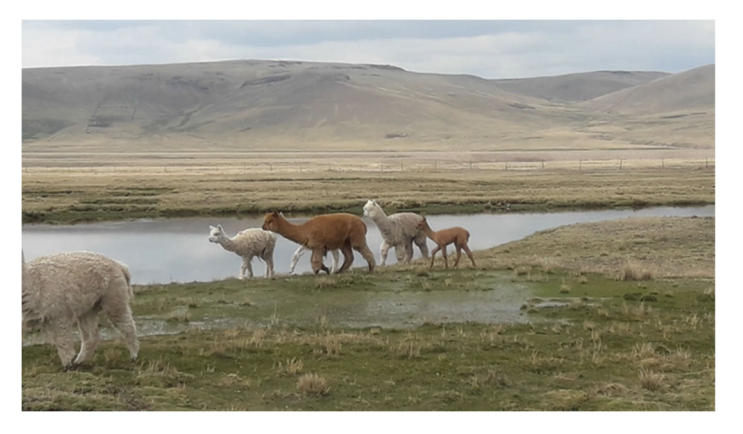
Herding in Caylloma