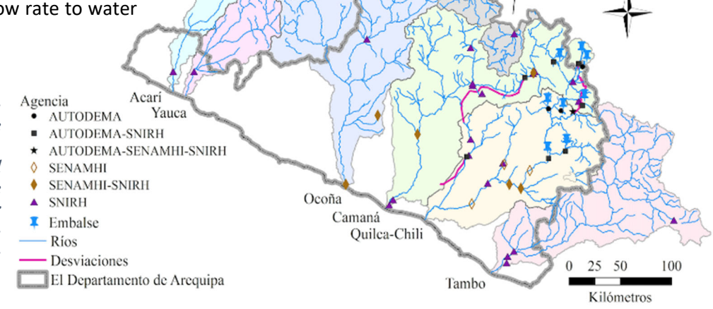
Figure 1. Locations of river discharge monitoring stations in the Arequipa Department, Peru. These locations are differentiated based on frequency and the type of measurement taken (daily or hourly flow). Rivers, large diversions, and dams are also identified in the map.

1) Daily stations report average volumetric flow rate (in m<sup>3</sup>/s) that is estimated from an established rating curve that related flow rate to water level, and